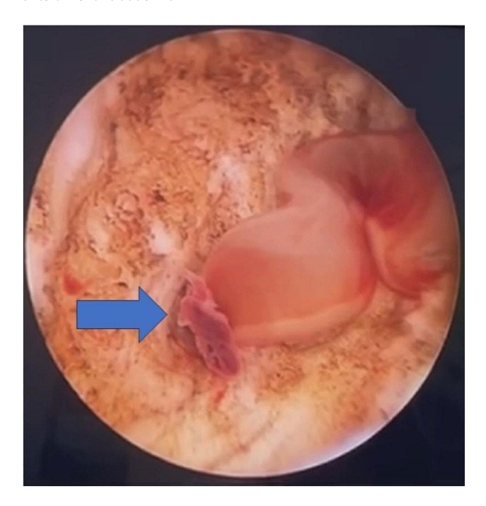
Fig. 2 A resection was carried out on the bladder wall, and white-yellow purulent discharge came out. (Blue arrow)