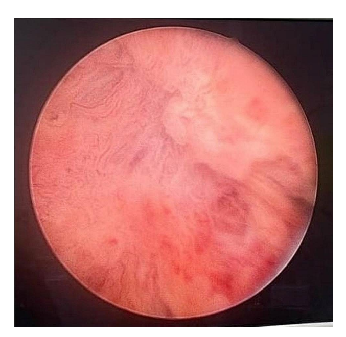
Fig. 3 Base of bladder wall abscess

Alfarizi et al. BMC Urology (2024) 24:109 Page 3 of 4