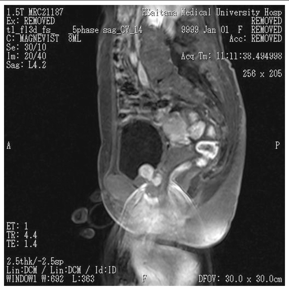
Figure 1 Sagittal section of a magnetic resonance image . Sagittal section of a magnetic resonance image shows a homogeneous mass (2.7 cm in diameter) occupying the area between the bladder neck and the anterior vaginal wall. The tumor mass was homogeneously enhanced after the injection of gadolinium.

We performed pre and post-operative (after three months) urodynamic studies (UDS) in this patient. The number of involuntary detrusor contractions decreased from 3 to 1 during a filling cystometry, and the values of first desire to void volume and maximum desire to void volume increased. Preoperatively, she voided with a Q_{\rm max} of 4 mL/sec and a P_{\rm det} of 177 cmH<sub>2</sub>O. Postoperatively, she voided with a Q_{\rm max} of 15 cm/s and a P_{\rm det} of