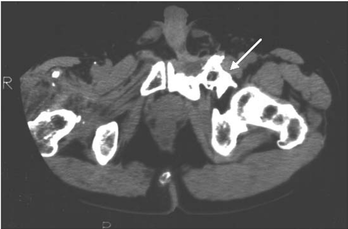
Figure 2 Computed tomography of the pelvis shows the fractured left pubic bone shifted to the left and head side (arrow).