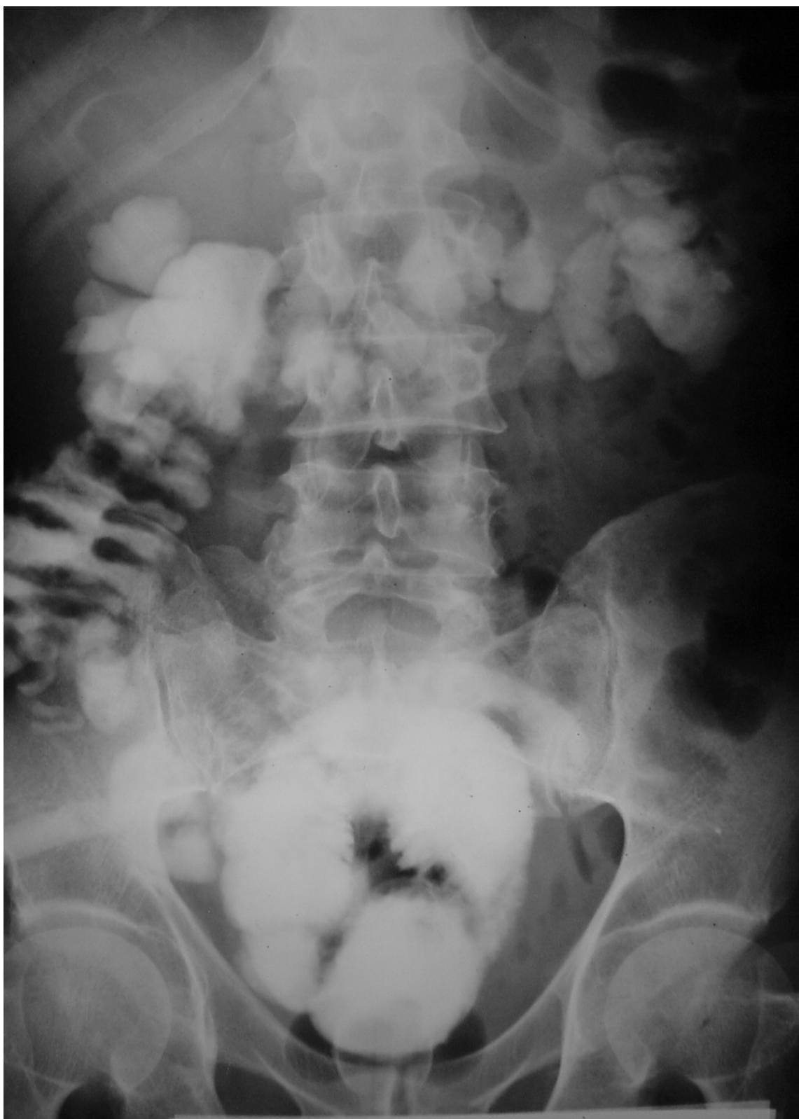
Figure 2 Pouchogram of the patient with entero-pouch fistula.